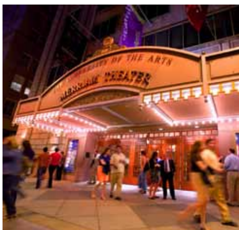
Merriam Theater