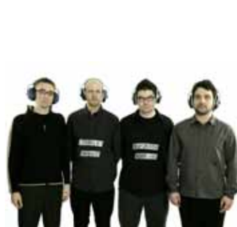
Sō Percussion Sat, Apr 23, 2011 | 7:30pm