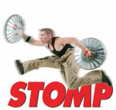
Stomp Feb 15 - 20, 2011 | Merriam Theater