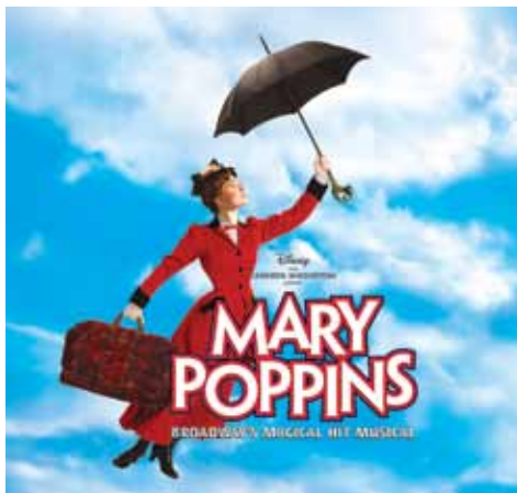
Mary Poppins Mar 26 - April 1, 2011 | Academy of Music