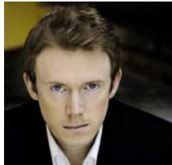
Daniel Harding w/ Dresden Staatskapelle Orchestra Tue, Nov 2, 2010 | 8pm