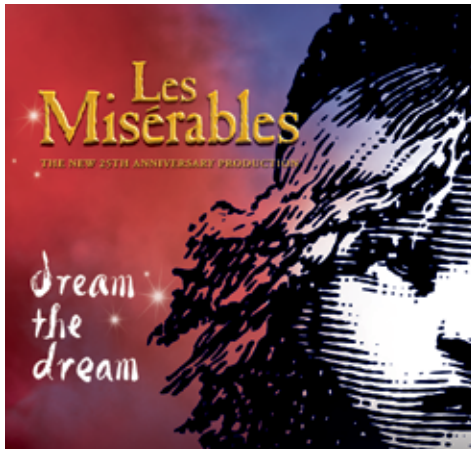
Les Misérables Jan 4 - 9, 2011 | Academy of Music