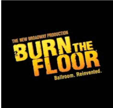
Burn The Floor Nov 12 - 14, 2010 | Academy of Music