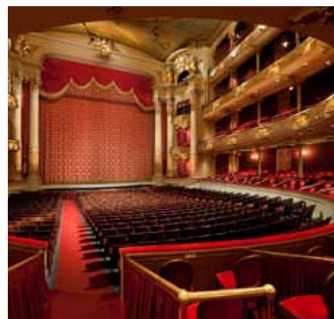
Academy of Music