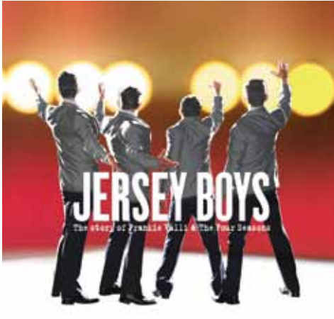
Jersey Boys Oct 5 - 10, 2010 | Forrest Theatre

PRESENTED IN ASSOCIATION WITH THE SHUBERT ORGANIZATION