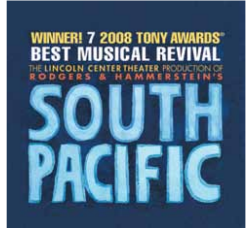
South Pacific Nov 23 - 28, 2010 | Academy of Music