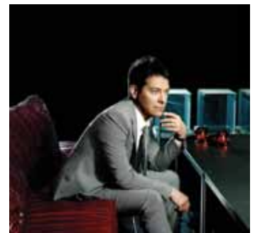
Marvin Hamlisch and Michael Feinstein Sun, Dec 26, 2010 | 3pm