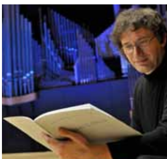
Thierry Escaich, organ Sat, Apr 16, 2011 | 3pm