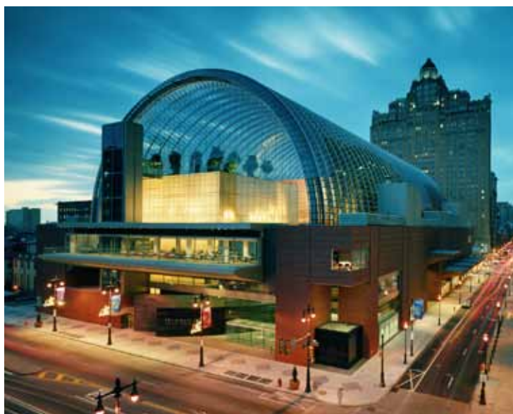
Kimmel Center for the Performing Arts