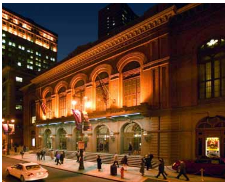
Academy of Music