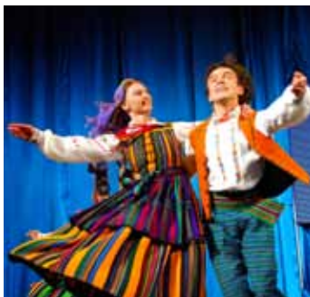
Mazowsze Sun, Nov 14, 2010 | 3pm