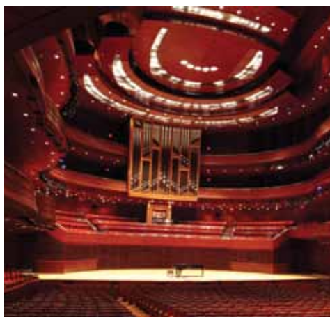
Verizon Hall