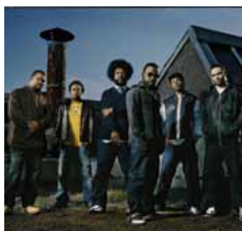
The Roots Sun, Apr 17, 2011 | 8pm