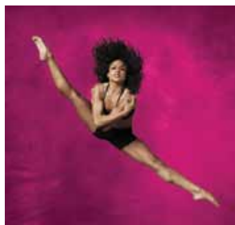
Alvin Ailey American Dance Theater Sat-Sun, Feb 26-27, 2011