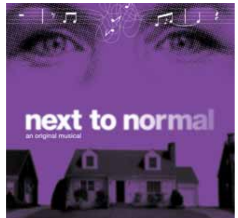
Next To Normal Jun 21 - 26, 2011 | Academy of Music