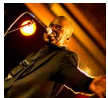
Maceo Parker Sat, May 14, 2011 | 8pm