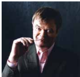
Garrison Keillor Mon, Nov 15, 2010 | 8pm