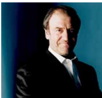
Valery Gergiev w/ London Symphony Orchestra Tue, Feb 22, 2011 | 8pm