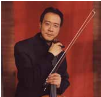
Yo-Yo Ma, cello Sun, Oct 17, 2010 | 7:30pm