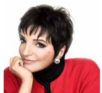
Liza Minnelli Sat, Nov 6, 2010 | 8pm