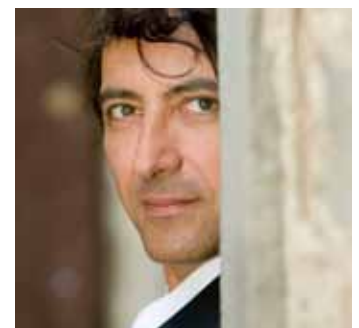
Daniele Gatti w/ Orchestre National de France Fri, Apr 15, 2011 | 8pm