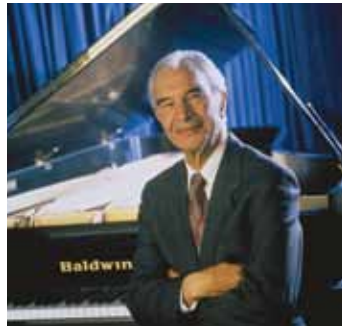
Dave Brubeck Tue, Oct 26, 2010 | 8pm